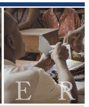
If there be among you a poor man... thou shalt open thine hand wide unto him, and shalt surely lend him sufficient for his need. DEUTERONOMY 15:7–8