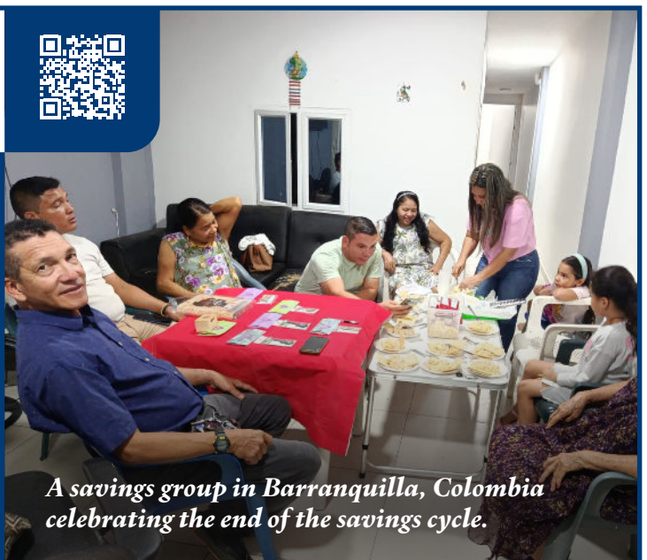
A savings group in Barranquilla, Colombia celebrating the end of the savings cycle.